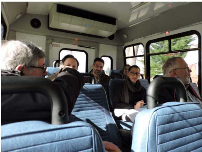
TOUR OF WEIRTON — City officials were joined by consultants Wednesday for a tour of Weirton as part of ongoing efforts to update the city's Comprehensive Development Plan. The tour included sites of ongoing and possible future development.

Trip part of effort to update Comprehensive Development Plan