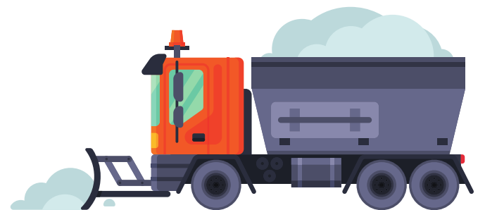
Salt & sand

BY BEING CAREFUL ABOUT WHAT GOES DOWN OUR STORM DRAINS, WE CAN HELP KEEP THESE BODIES OF WATER CLEAN.