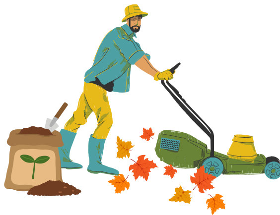
Lawn clippings, leaves, & fertilizer