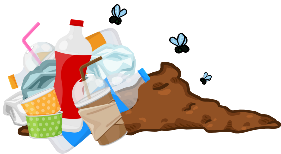
Trash & dirt