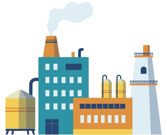
Spills & runoff